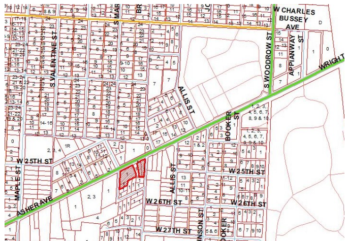
Figure 3. Master Street Plan

The site is bound to the north by Asher Avenue, designated a Minor Arterial. To the west is Martin Street and to the east is Brown Street, both are a Local Street on the Master Street Plan. A Minor Arterial provides connections to and through an urban area and their primary function is to provide short distance travel within the urbanized area. Since a Minor Arterial is designed to be a high-volume road, a minimum of 4 travel lanes and 90-foot right-of-way and two sidewalks is required. Asher Avenue has an 'Alternative Standard' of a 70 right-of-way with four lane section. Local Streets